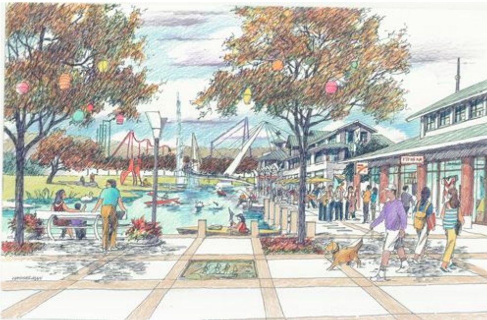
View from Public Entertainment Zone toward Six Flags

Another key Guiding Principle is long-term economic sustainability through the creation of local jobs and generation of revenues for Solano County and the City of Vallejo. Economists estimate the mix of uses included in the Project Vision could house approximately 2,500 permanent jobs, 5,700 construction jobs spread over the build-out period, and have an annual gross sales volume of over $400 million once build-out and stabilization is achieved. This could generate net new revenues to the City from taxes of approximately $8.5 million and new revenues to the County from ground lease rents. Full development and build-out of the site could represent in excess of $500 million in new investment in Solano County.